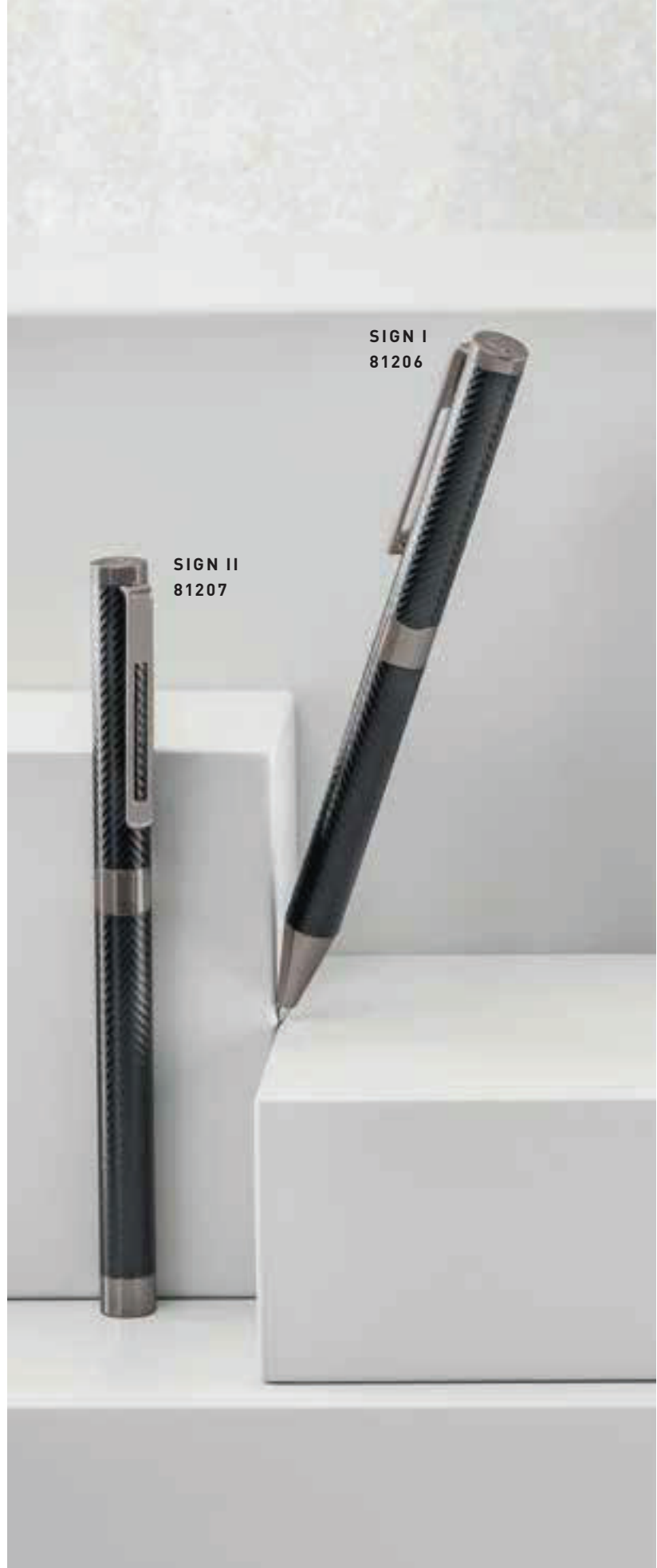
SIGN II 81207